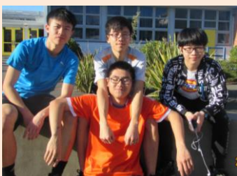
Time to relax