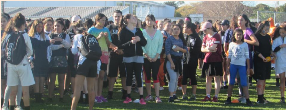
Just about ready to go

2017 Cross-Country Run: This annual event is more of a fun-run for many students with the more competitive runners giving their all. Nearly all the international students took part this year with many finishing in the Top 20 of their section.