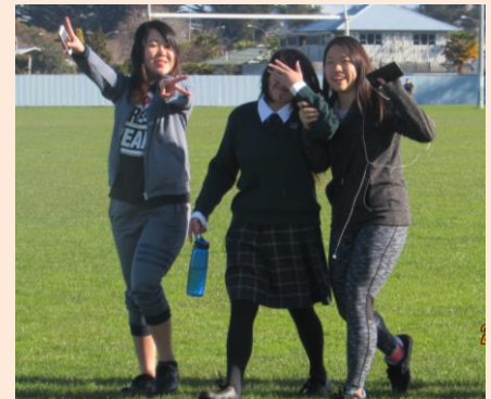
Some took it easy