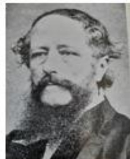
Rev. William Colenso