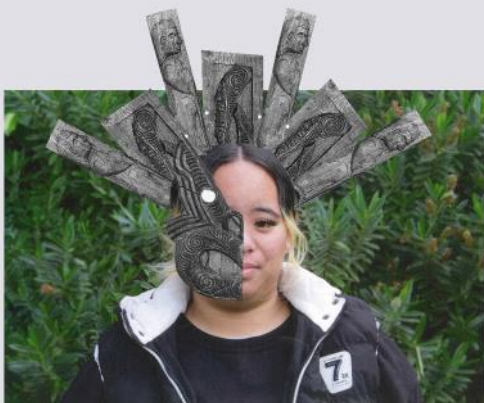
Reclaiming my Culture (after Hannah Hoch)

Hawke's Bay Secondary Schools' Maori Art Exhibition CAN Napier, 16 Byron Street November 15 - 28 Opening 5.00 Rāpare 15 2024